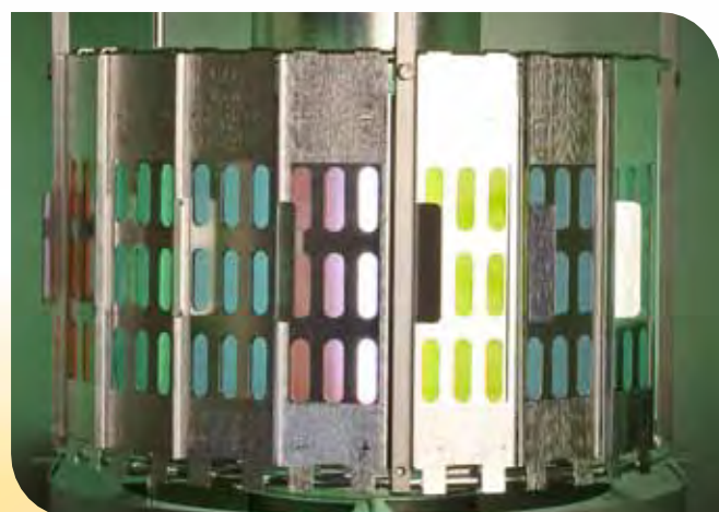
SEPAP MHE Specimen Rack

To simulate the effects of water, the SEPAP MHE+ is equipped with a specimen spray system.