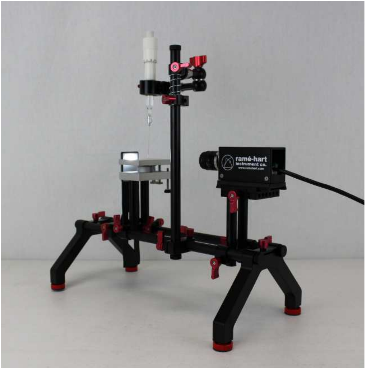
Model 90 Pro Edition Contact Angle Goniometer / Tensiometer