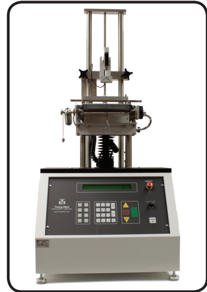
1270 PCA Score Bend shown with optional Bending Fixture